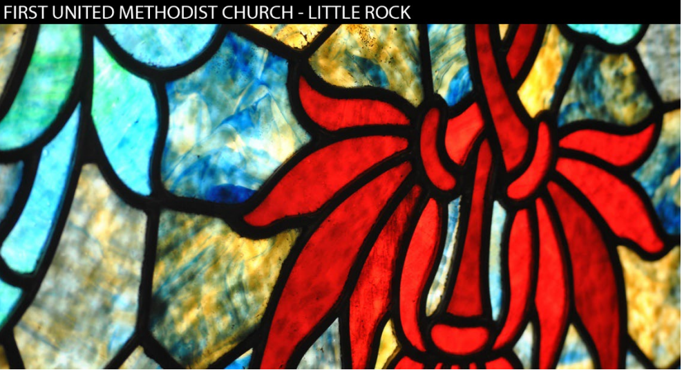
May 11, 2025 | FIRST TRADITION 11:00 AM | Fourth Sunday Of Easter