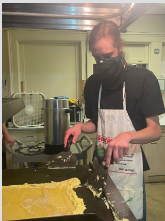
Quapaw Quarter Community Breakfast