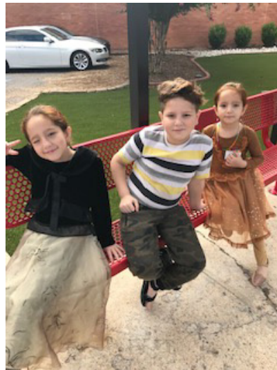
Big brother and the 2 sisters

Father and Mother have expressed their deep gratitude for ALL the gifts they received at the Baby Shower held at First Cup Cafe in August. From blankets to onesies, to diapers and multiple gift cards to car seat, swing and and so much more... ALL items gratefully received. They say Thank you to the Church people !!! Baby girl arrived on September 7, and she is beautiful !